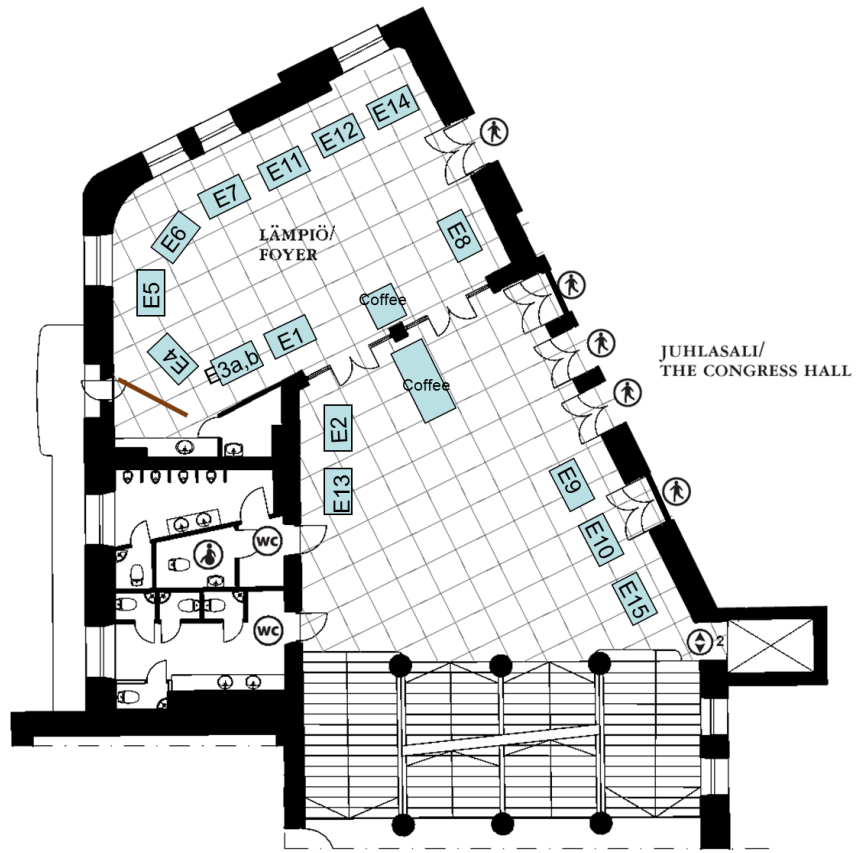
Figure 1 Exhibition area